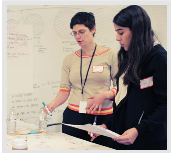
PODS co-design workshop, February 2014

Over a period of eight months, OpenLab (formerly CICC) used a combination of methods to understand the types of information patients want to and should know, and the design features that would make PODS usable for a wide range of patients and yet practical for providers to implement.