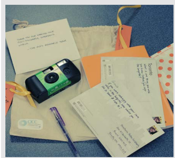
Cultural probe kit.

to the reader, listing important points in list format, and using left justification so there is even spacing between words. An illustrated medication schedule has also been shown to be effective 20 .