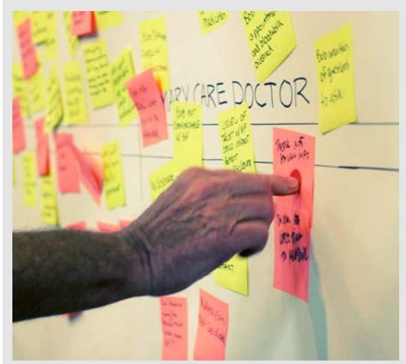
Patient experience mapping exercise, Nov. 2013