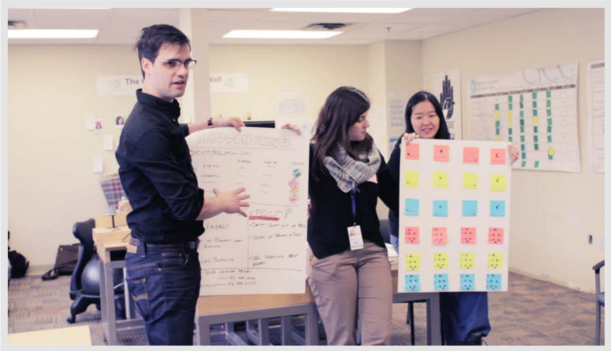
PODS co-design workshop, February 2014

The period following discharge from hospital is a vulnerable time for patients. The transition of care from hospital to community or from hospital staff to patient self-management can result in adverse events leading to avoidable ED visits, hospitalizations and poor patient outcomes. Clearly communicating important information that patients need to know the moment they leave the hospital seems sensible, but is often not done in practice for a variety of reasons.